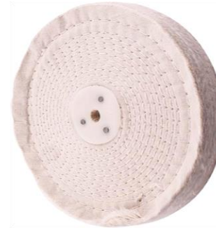
Cotton White Stitched Mops