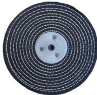
Colour Stitched Mop