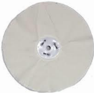
Cotton Loose Mops