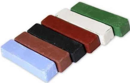
Polishing Compound Bars