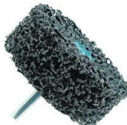
Mini Spindle Wheel

Mandrels are available to be used in a hand tool