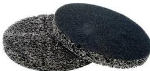
Velcro Hook Disc